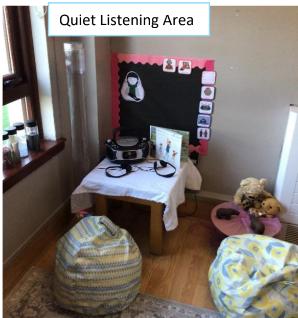
Quiet Listening Area