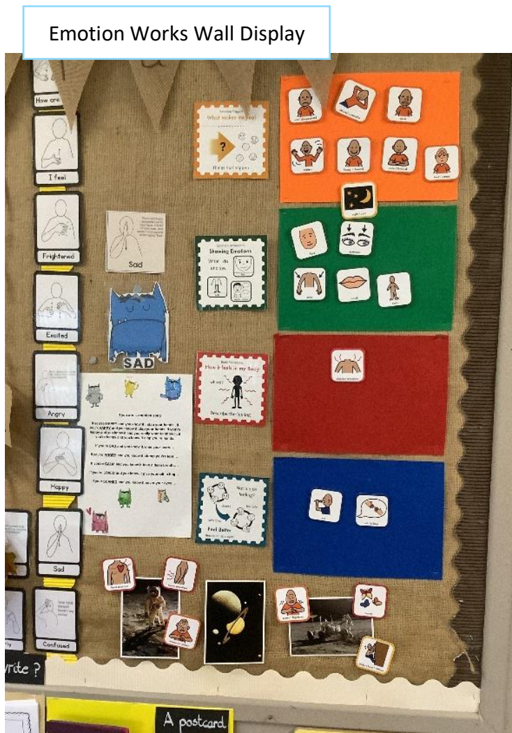
Emotion Works Wall Display