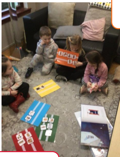
Emotion Words (naming feelings)

The progression of the children can be highlighted when they noticed how sad and lonely the main character seemed, and they wanted to send a letter to the boy offering to be his friend (REGULATION / 'FEEL BETTER' STRATEGIES).